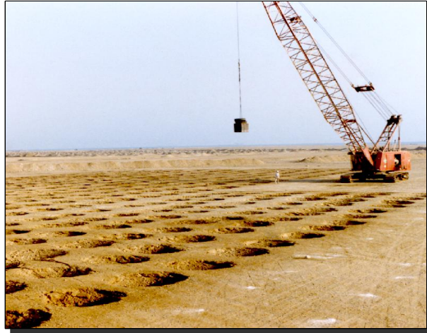
Hail Al Bathna, Saudi Arabia

The cost of dynamic compaction is primarily dependent on such factors as subsurface conditions, the depth and degree of improvement required, and the size of the project. Our dynamic compaction costs have ranged from less than $30,000 to over $5,000,000 .