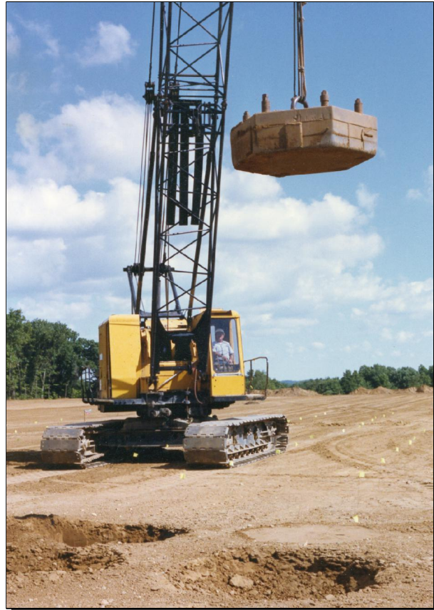
Battle Creek, MI