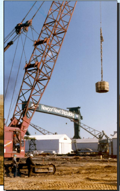
Newport News, VA